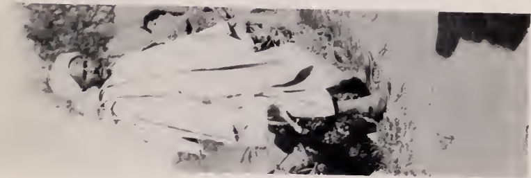
A Kabyle laborer with a background of cacti